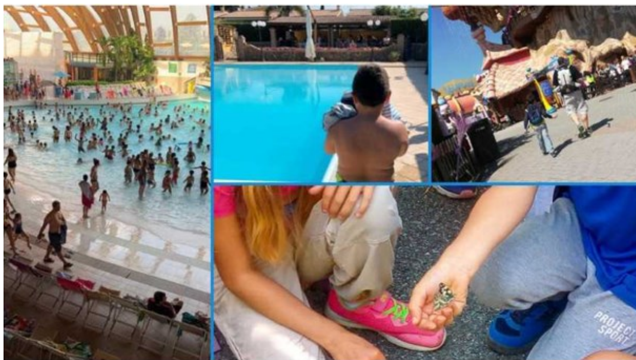
Some moments of the "Summer Camps" & "Disability does not leave on holiday" initiatives

We have allocated part of the donations to Summer Camp fees for 16 children . During Summer 2019, we financed 45 weeks of pure fun with peers at the Summer Camps, 38 of which in Aosta Valley, 3 in Lombardy, and 4 in Lazio.