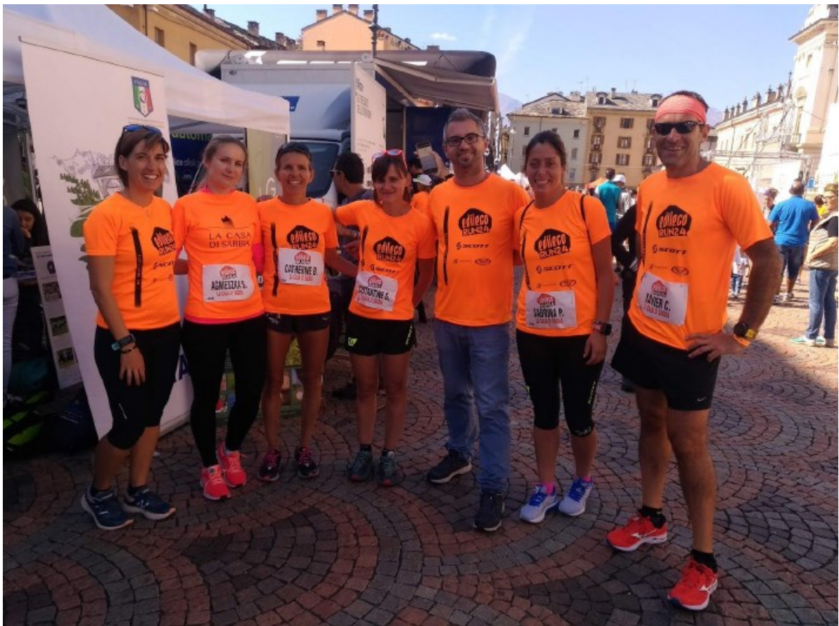
Some members of our Race Team