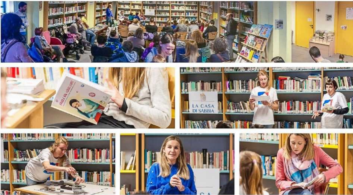
Some moments during the presentation of the book at the Saint Vincent Library.