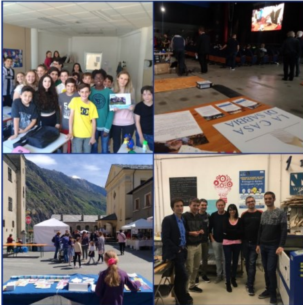
Above: Pupils of the school of Quart and EduTech Conference.

of future production processes and closely linked to the innovation and start-up system. In the frame of the conference, “Let’s Play Together” initiative was presented.